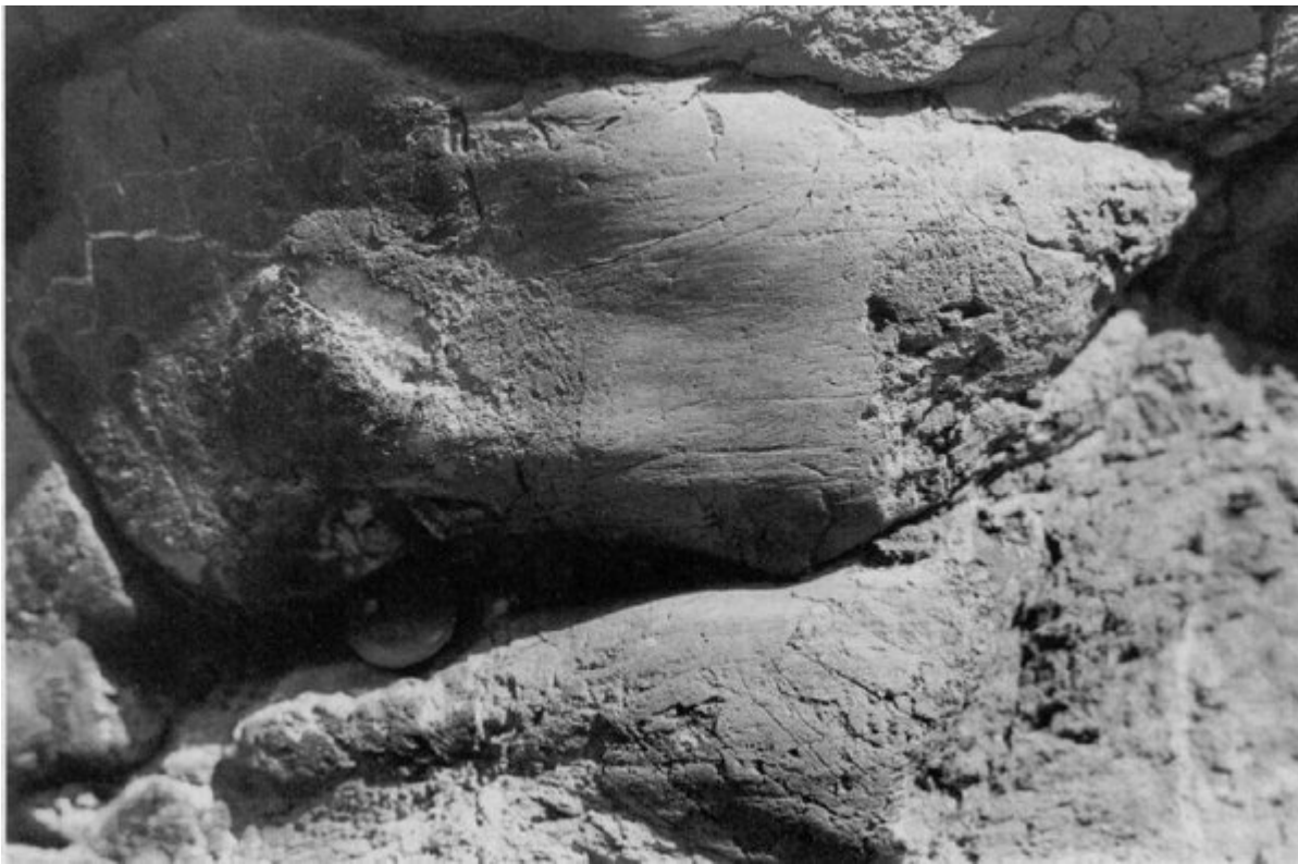
(Figure 17.2) Part of the smoothed and grooved rock surface at Agassiz Rock, Edinburgh, which has been attributed to glacial abrasion. The form of the rock surface bears a strong resemblance to glacially abraded surfaces elsewhere in Scotland and in modern glacial environments