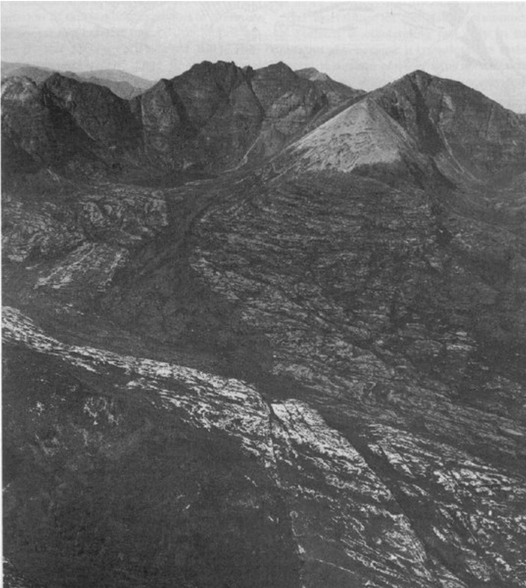
(Figure 6.7) The east flank of An Teallach. A clear lateral moraine and drift limit (centre) mark the extent of the Loch Lomond Readvance glacier that occupied the corrie of Toll an Lochain. The ice-scoured Torridonian sandstone of the lower slopes contrasts with the frost-shattered slopes of the mountain ridge and the quartzite blockslopes on Glas Mheall Liath. (British Geological Survey photograph D2102.)