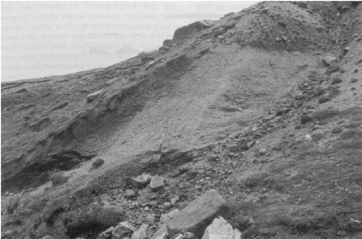
(Figure 3.2) Sediment sequence at Fugla Ness, Shetland, showing interglacial peat (lower left) overlain by slope deposits, with till at the top.