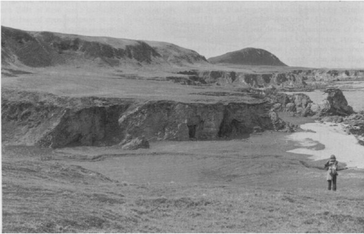
(Figure 11.10) The coast of northern Islay, south of Rubha a'Mhail, showing the High Rock Platform and its backing cliff. In the foreground the Main Rock Platform and its backing cliff are also clearly developed.