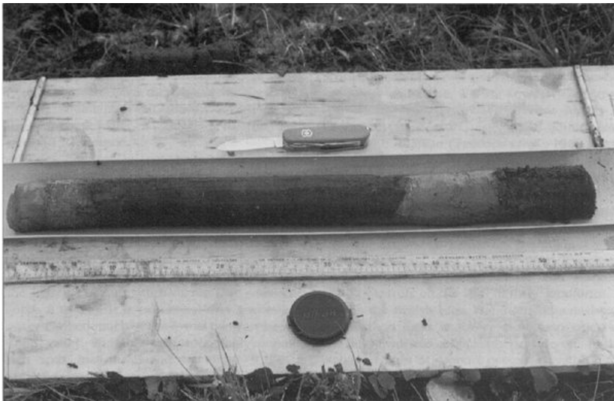
(Figure 13.12) Core from the basal sediments at Tynaspirit. From the left, the sequence comprises Late Devensian minerogenic sediments, organic Lateglacial Interstadial sediments, Loch Lomond Stadial silts and clays, and early Holocene organic lake muds.