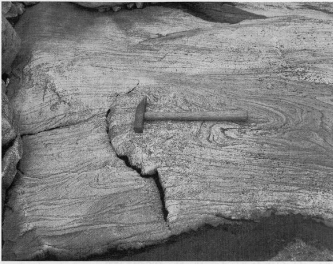
(Figure 7.11) Cross-bedding and slump structures in psammite with micaceous laminae. Succession youngs to the east (top of photo). The hammer is 37 cm long. Abhainn Gleann nan Fiadh [NH 1945 2591].