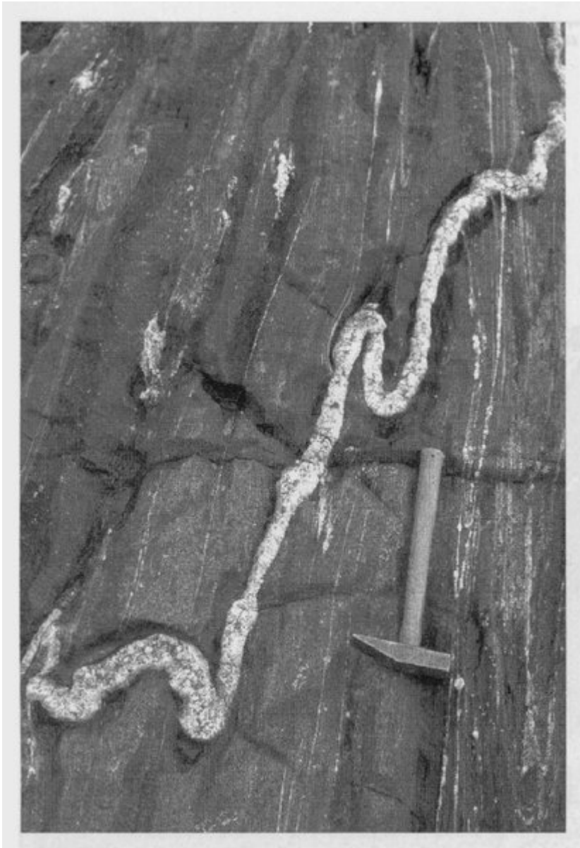
(Figure 6.24) Sheared amphibolitic mafic rocks inter-banded with micaceous psammite and semipelite, showing tight F2 folds, cut by a quartz-feldspar pegmatite vein that is in turn deformed and folded by F3 folds. The hammer (37 cm long) is aligned with its handle parallel to the trace of the dominant planar fabric (S2). The exposure lies in the Naver Thrust Zone and Torrisdale Steep Belt. Druim Chuibhe, Torrisdale Bay [NC 6901 6167].