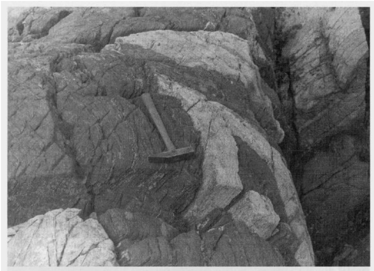
(Figure 3.26) Amphibolite (Loch Maree Group) cut by pale-grey granodiorite sheets (Ard Gneisses) that themselves are tightly folded. Note the steeply plunging lineation parallel to the fold axes. The hammer is 37 cm long. An Ard peninsula [NG 803 753].