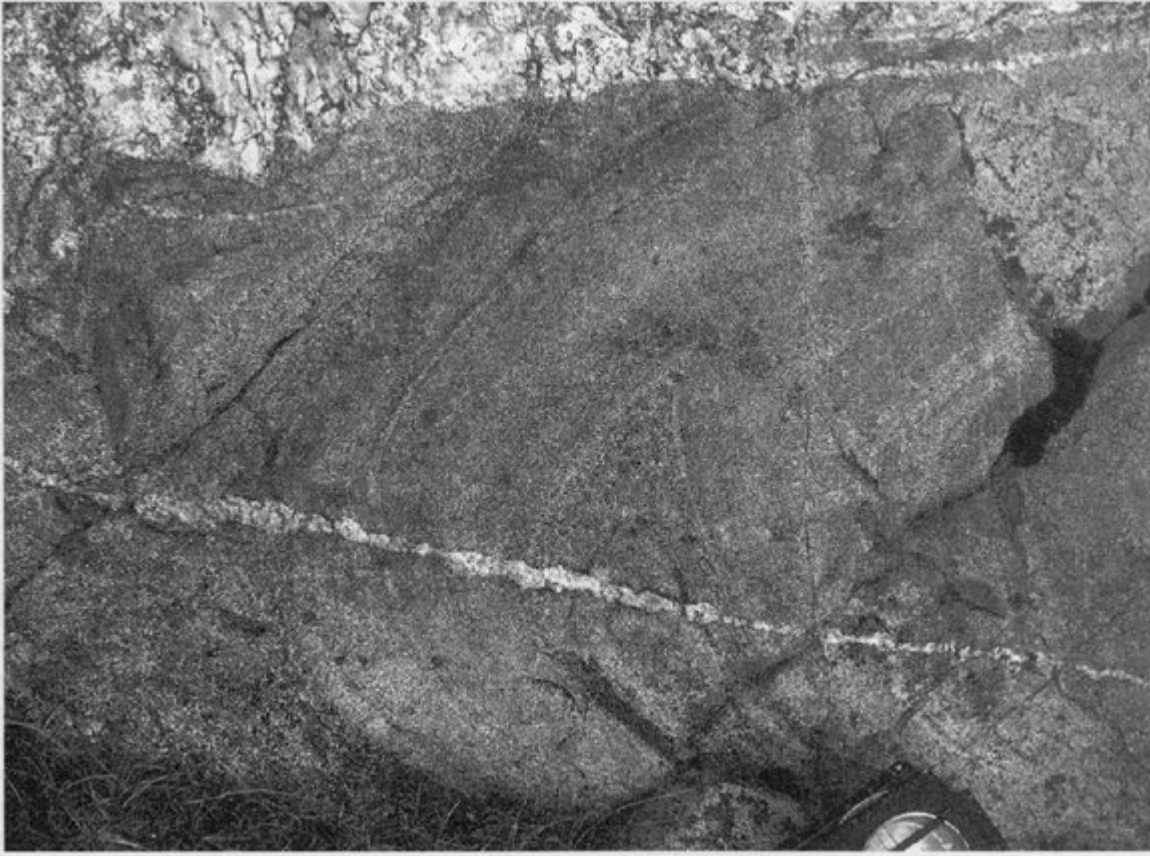
(Figure 6.26) Hook-shaped fold formed by superimposition of an upright F3 fold on an earlier tight recumbent F2 minor fold. A later non-foliated pegmatitic granite vein cross-cuts the refolded structure. On hillside above Creag Ruadh at [NC 6982 6300].