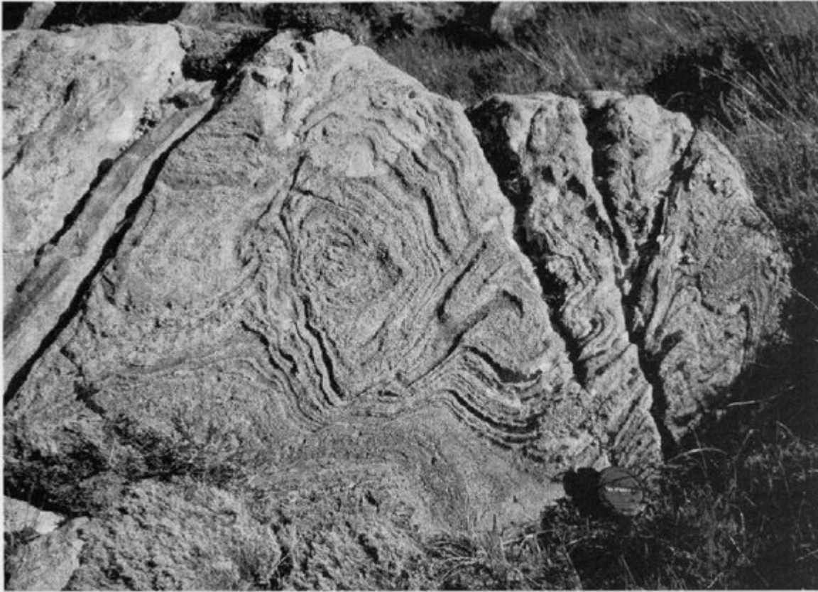
(Figure 7.27) Fold interference structure in layered Moine psammite, near the hinge of the Beinn a' Chapuill Fold at Sron an Fheadain. The lens cap (lower right) is 5.2 cm across.