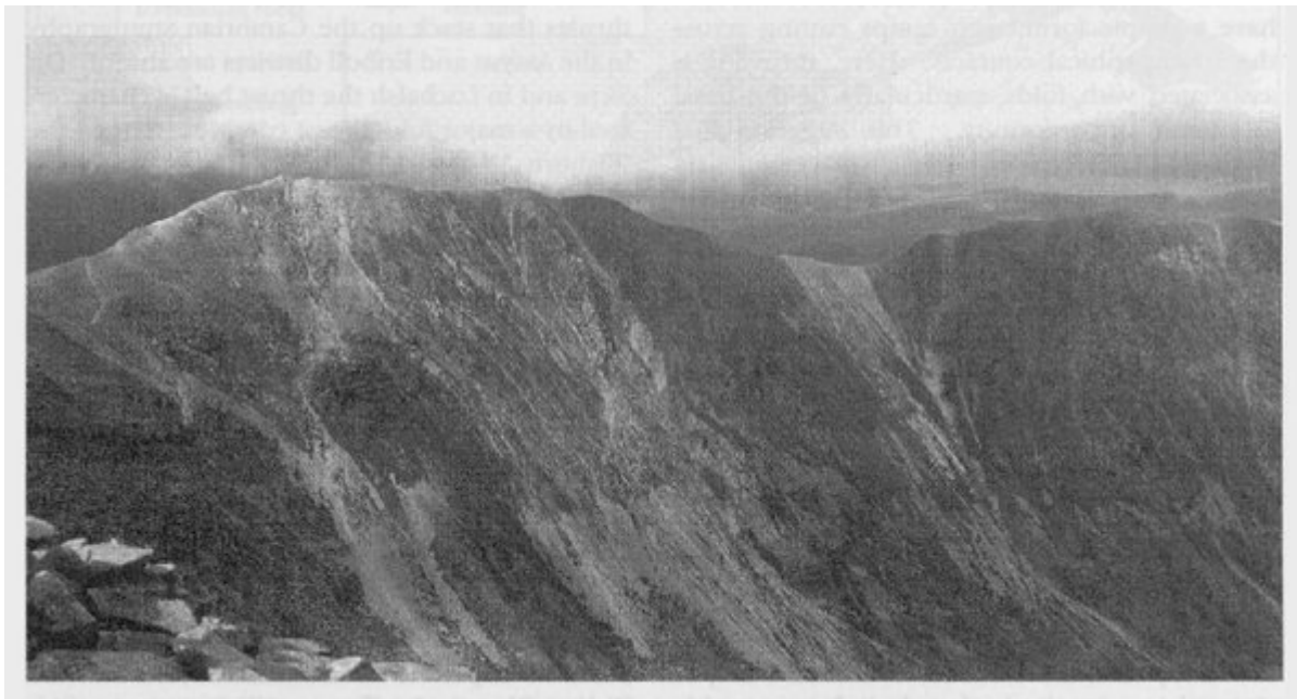
(Figure 5.47) The south side of the Beinn Liath Mhor ridge from Sgorr Ruadh. Steep thrusts separate imbricate thrust slices containing Torridon Group sandstones and Cambrian quartzites. A hangingwall anticline occurs left of centre. Compare with cross-section shown in Figure 5.46b.