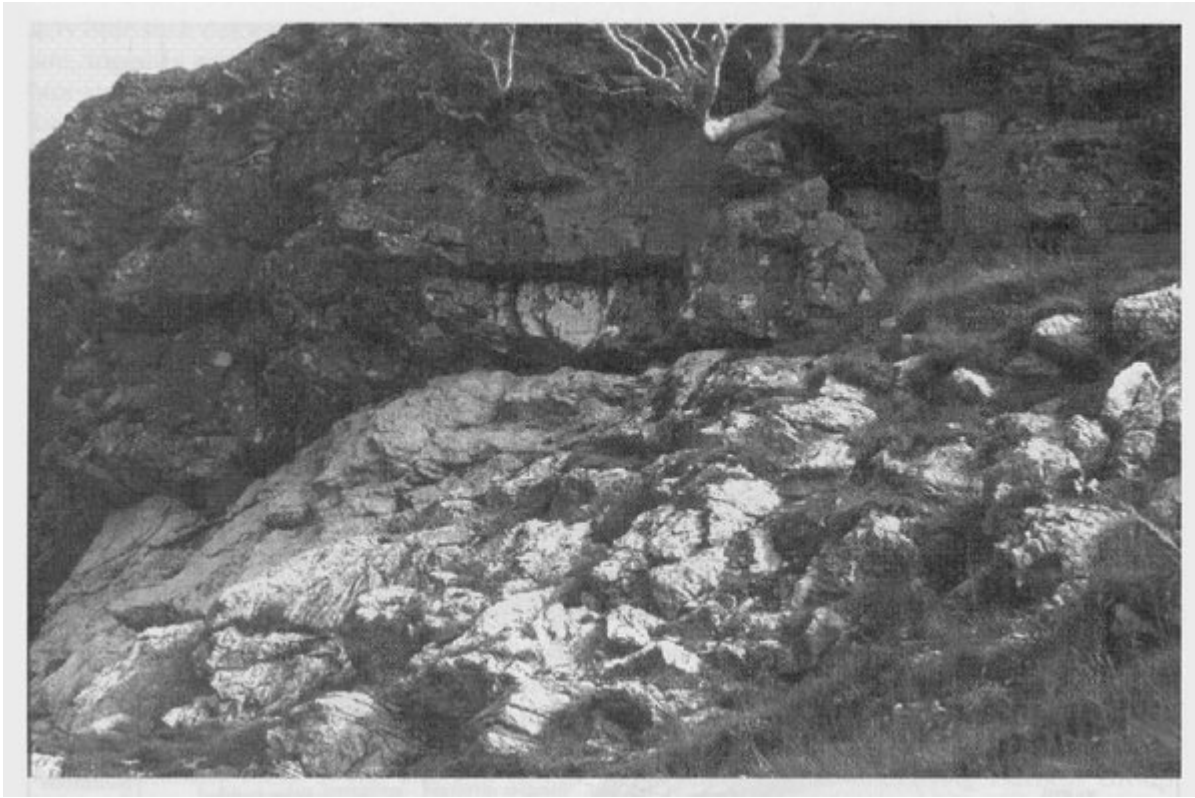
(Figure 5.36) The Moine Thrust at Knockan Crag. The dark-grey rocks above are mylonitic Moine rocks; the cream-weathered rocks below are Durness Group carbonate rocks.