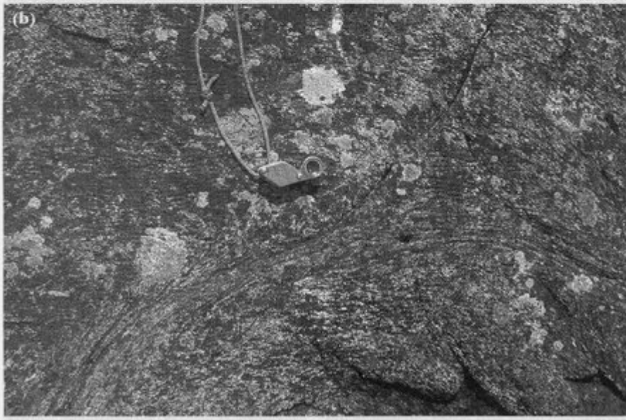
(Figure 2.16) (a) 'Younger Basic' dykes and pods at Rubha Ghriminis (Griminish Point). Note that although the dykes are boudinaged, foliated and now amphibolites, they cross-cut the prominently banded Archaean felsic and mafic gneisses. (b) Small shear-zone in granulite-facies 'Younger Basic' body at Caisteal Odair. Relative dextral movement across the shear zone can be inferred from the foliation traces. The hand lens is 6 cm long.