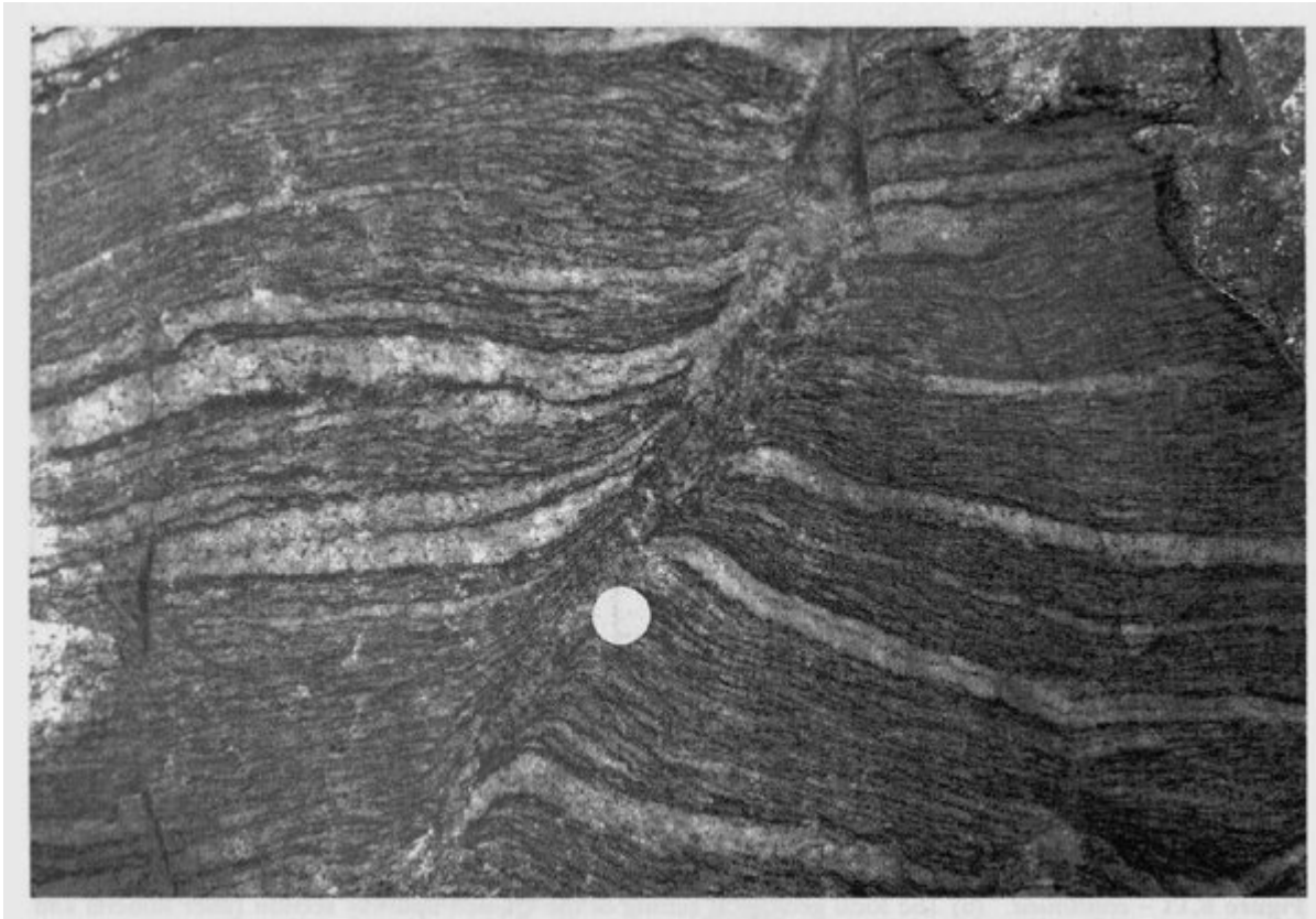
(Figure 8.12) Typical aspect of the Quoich Granite Gneiss at the site, showing the gneissose foliation and migmatitic segregations deformed by a sinistral ductile shear-zone. The coin is 2.4 cm in diameter.