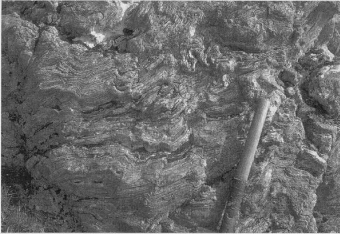
(Figure 5.51) Close-up view of laminated mylonite below the Moine Thrust, with abundant late kink-folds, some of which form conjugate sets (e.g. left of centre). Western shore of Slumbay Island.