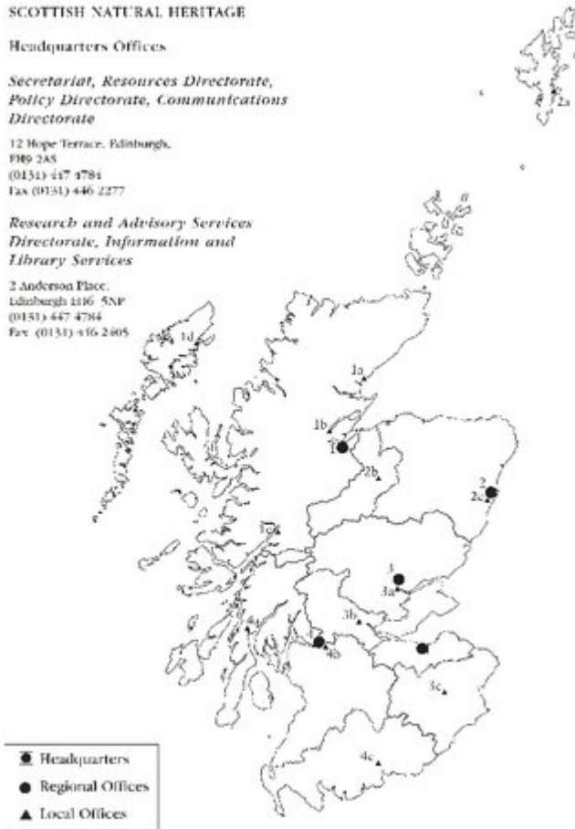
(Map 3) Scottish Natural Heritage. Countryside Council for Wales. Regional and local offices.

2 Anderson Place, Edinburgh EH16 5NP (0131) 447 4784 Fax (0131) 416 2405