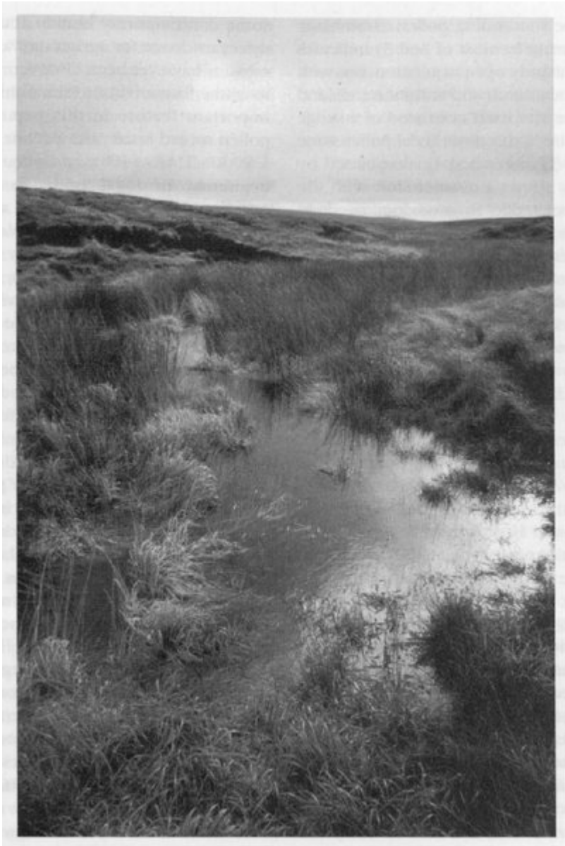
(Figure 4.17) The peat bog at the south-west end of Dozmary Pool, Bodmin Moor.