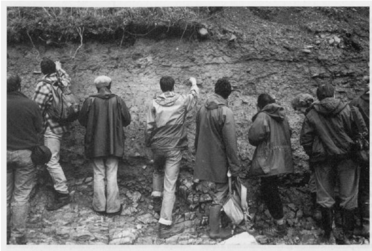
(Figure 7.7) Members of the Quaternary Research Association discuss possible evidence for glaciotectonism at the base of the Pleistocene succession towards the eastern end of the Fremington Quay exposures.