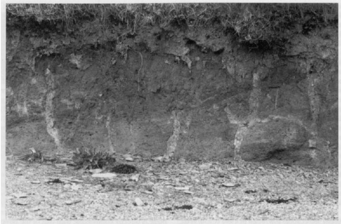
(Figure 7.5) The Pleistocene sequence towards the western end of the Fremington Quay exposure. The vertical 'pipe' structures are infilled with lighter-coloured silt and clay, and penetrate beyond the base of the exposure: they may be frost or desiccation cracks (Wood, 1970).