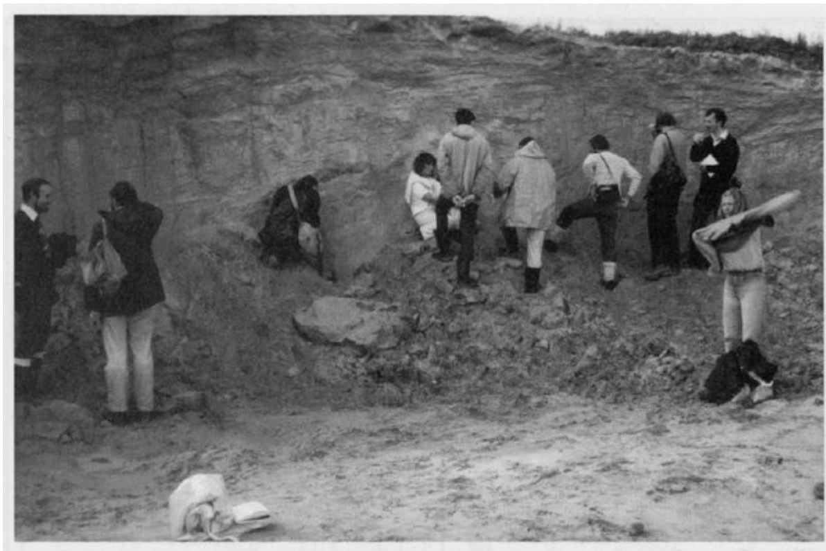
(Figure 3.8) Members of the Quaternary Research Association examine the sequence at St Agnes during the Annual Field Trip to west Cornwall in 1980. The sands are overlain unconformably by periglacial head.