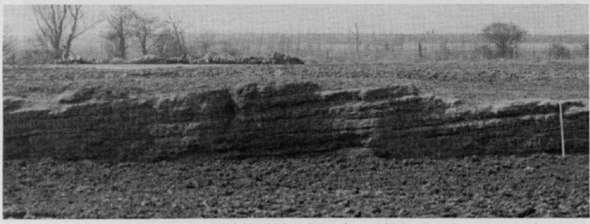
(Figure 10.22) Gently dipping beds of the Aldeburgh Member at Aldeburgh Hall. Scale is 1 m long.