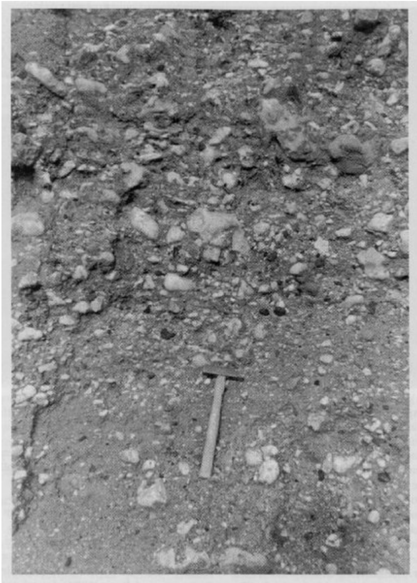
(Figure 7.8) Badly sorted, poorly bedded gravel unit within the Aller Sand Pit section. The larger pebbles are predominantly flints. The small, dark pebbles comprise chert and various exotic lithologies. (Photograph: B. Daley, taken in November 1997.)