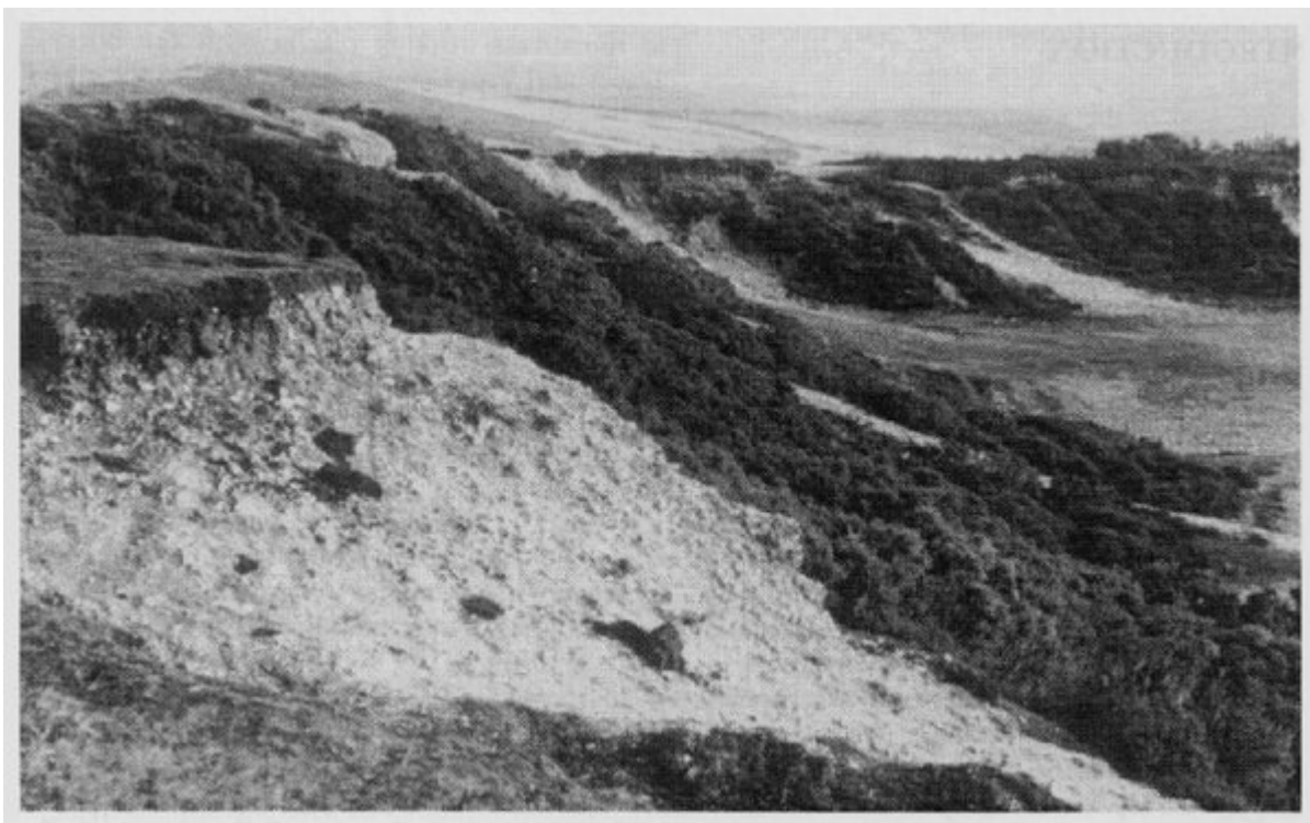
(Figure 7.2) Blackdown, Dorset. Blackdown Gravel exposed in the disused quarry to the south of Hardy's monument