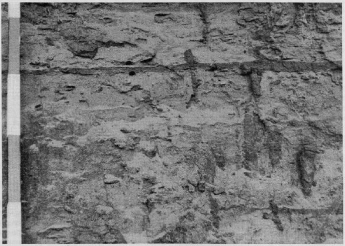
(Figure 11.16) Vertical burrows in unit 3 at Broom Covert. (Graduations on scale = 10 cm.)