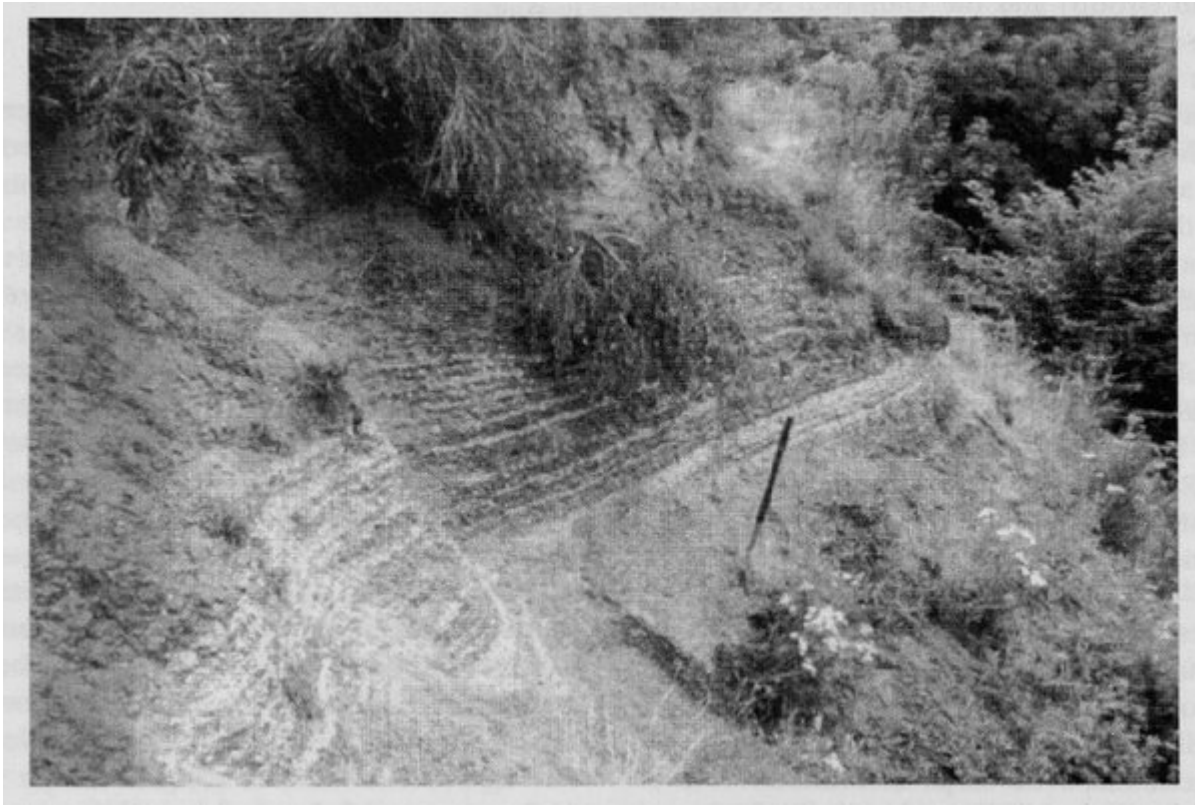
(Figure 3.17) Charlton Sand Pit, Maryon Park, Greenwich, Kent. The 'Woolwich Shell Bed' (Woolwich Formation).