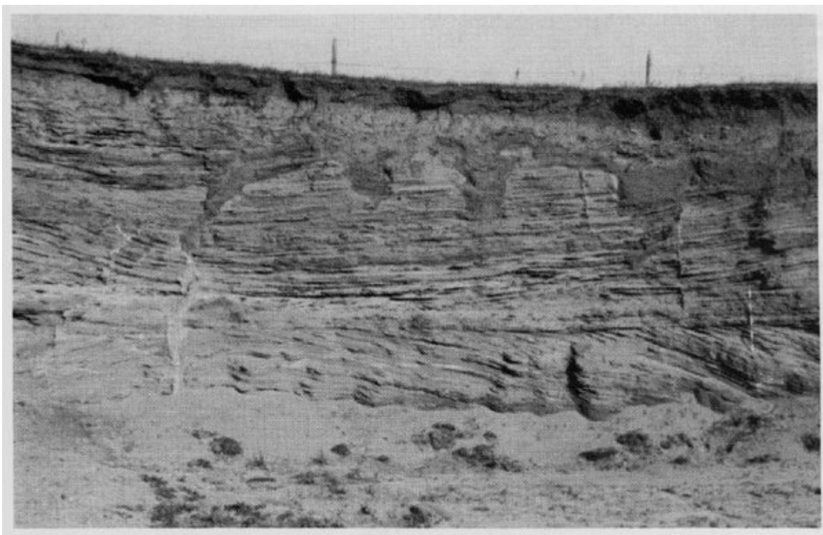
(Figure 11.19) Section at Orford Lodge showing prominent solution pipes. Scale is 1 m long.