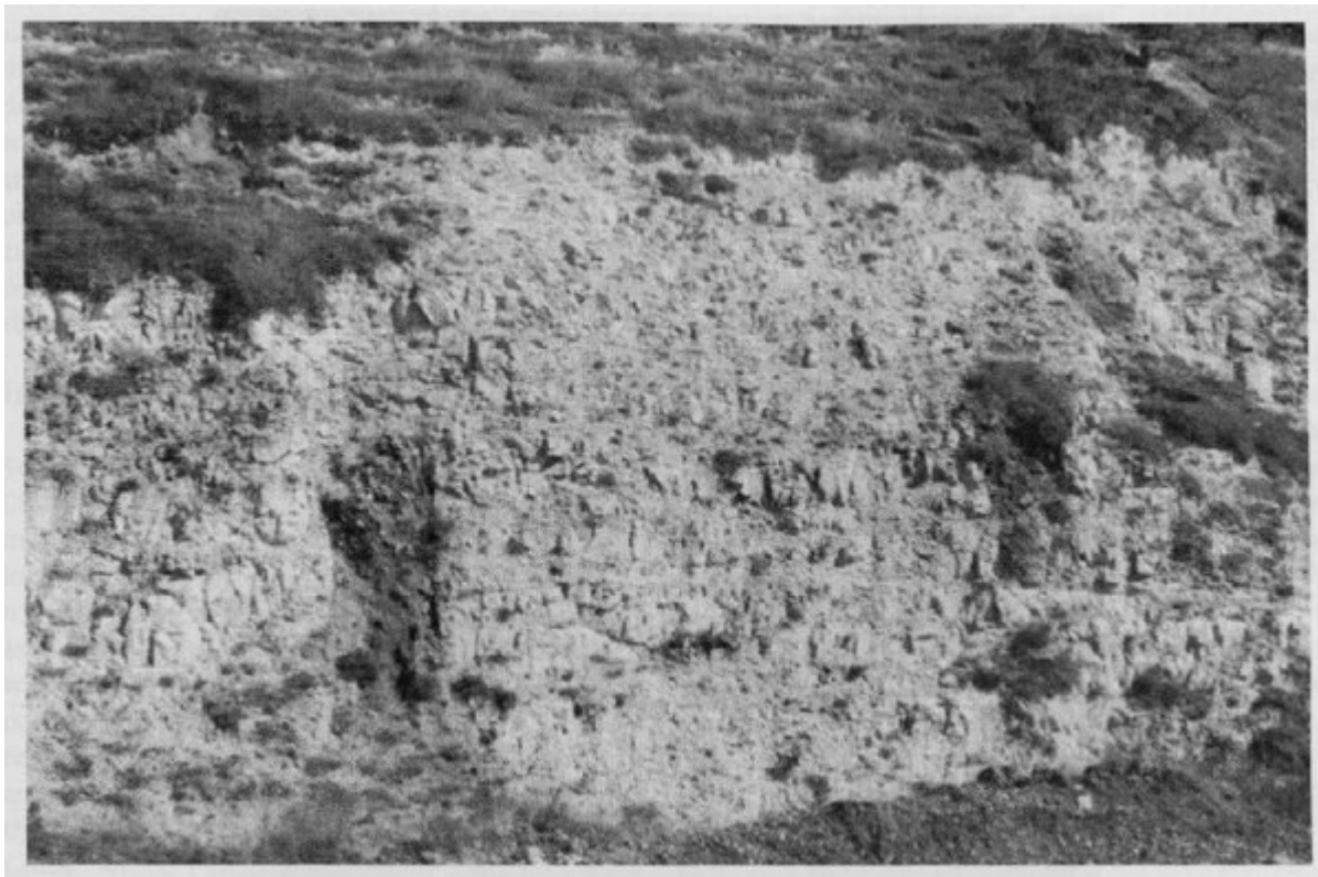
(Figure 9.5) Conserved face in Pivington Quarry showing remnants of solution pipes. The photograph shows 15 m of lateral exposure.