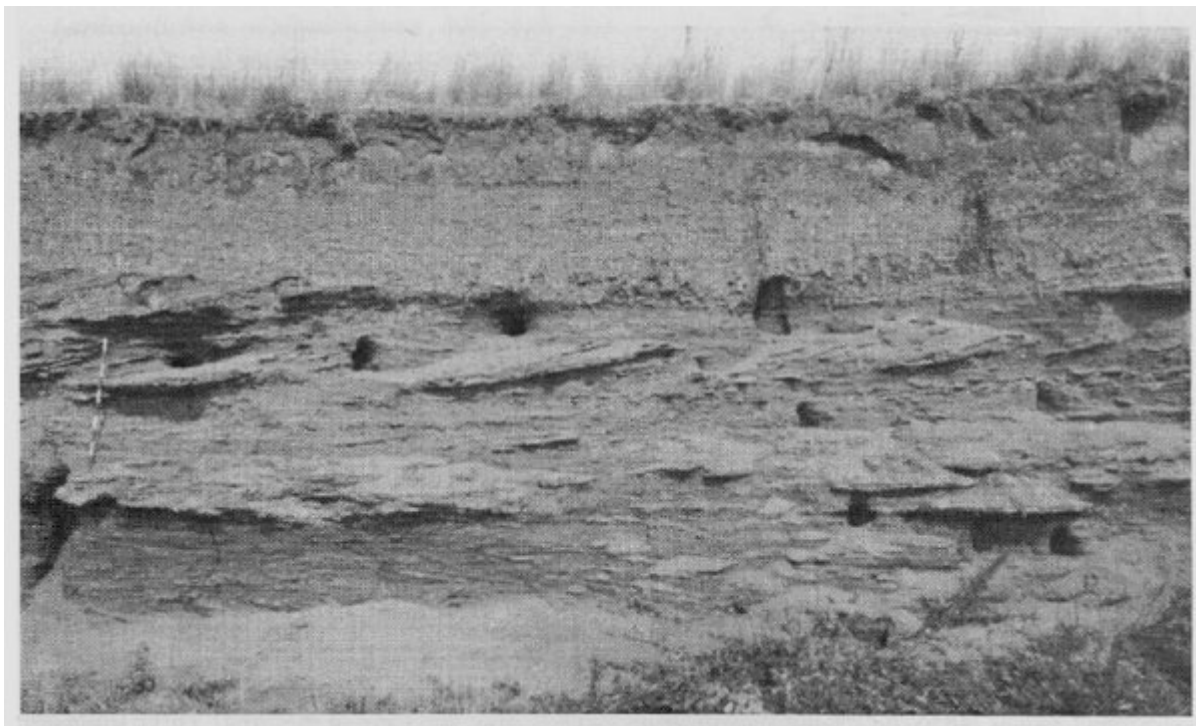
(Figure 11.12) Red Crag exposure at Vale Farm showing possible spring-neap tidal rhythms in unit 2 and truncation by the overlying unit 3. Scale is 1 m long.