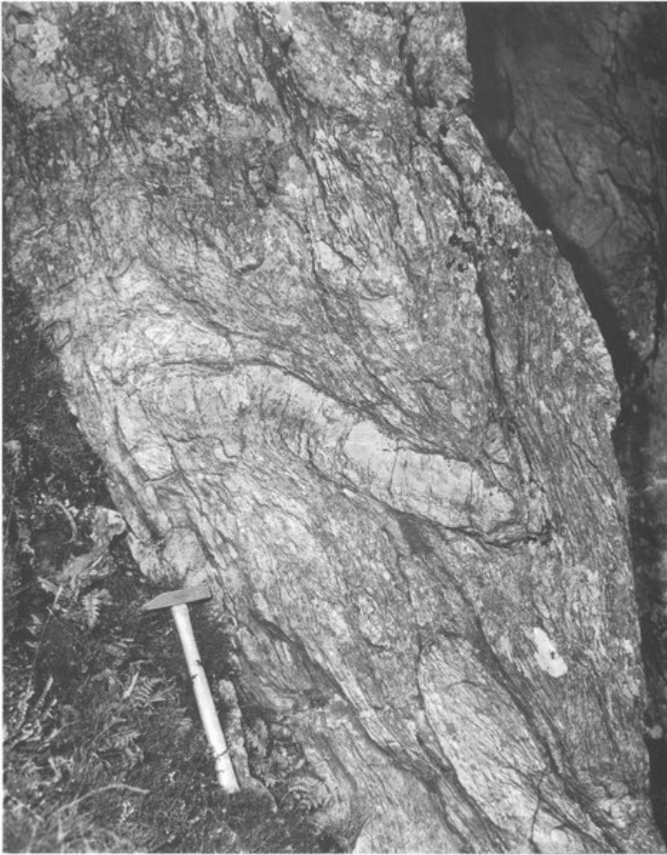
(Figure 3.7) Goat Crag, Buttermere. The sandstone lens is part of a slump-generated mélange which has been folded by minor D_1 folds with a poorly developed axial-planar cleavage.