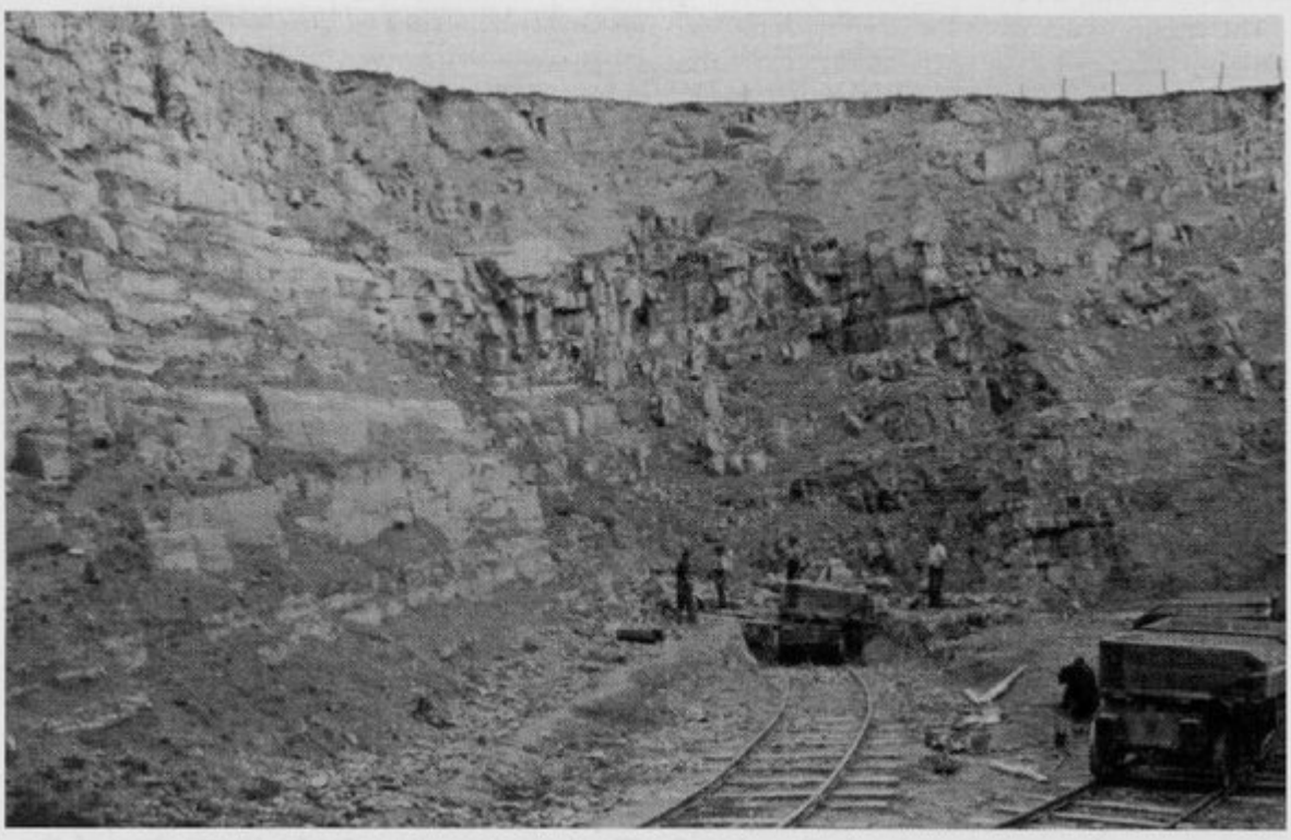
(Figure 13.21) Photograph of Lime Kiln Quarries, the marly chalk seen (above the talus) in the left (north) face of the quarry is in the Zone of Holaster subglobosus ; that in the lowest 3 m or so of the farther (east) face is in the Zone of Schloenbachia varians .