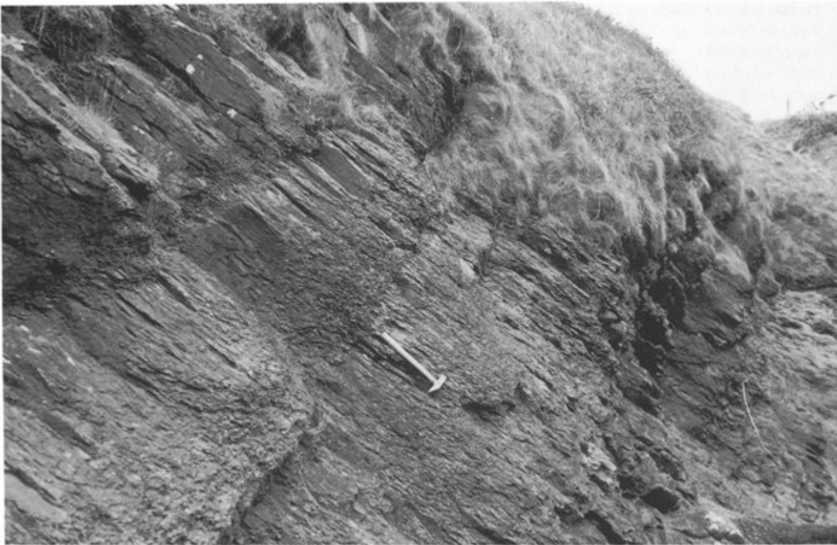
(Figure 4.20) Lligwy Bay, Anglesey. Strongly developed, spaced cleavage in ?Devonian siltstones dips to the north in the hinge of a south-facing monocline.