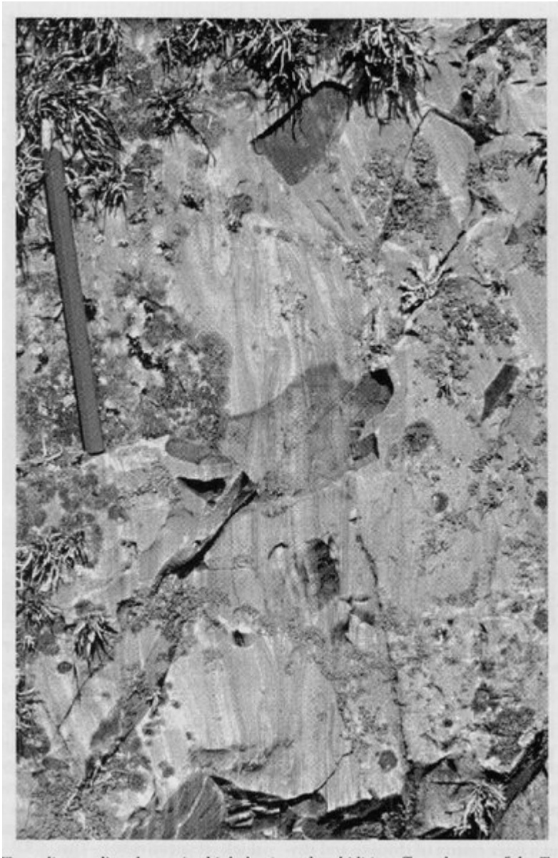
(Figure 6.16) Wet sediment disturbance in thinly laminated turbiditic tuffs at the top of the Trwyn yr Allt Tuff, Cader Rhwydog Member, Cam Llundain, Ramsey Island.