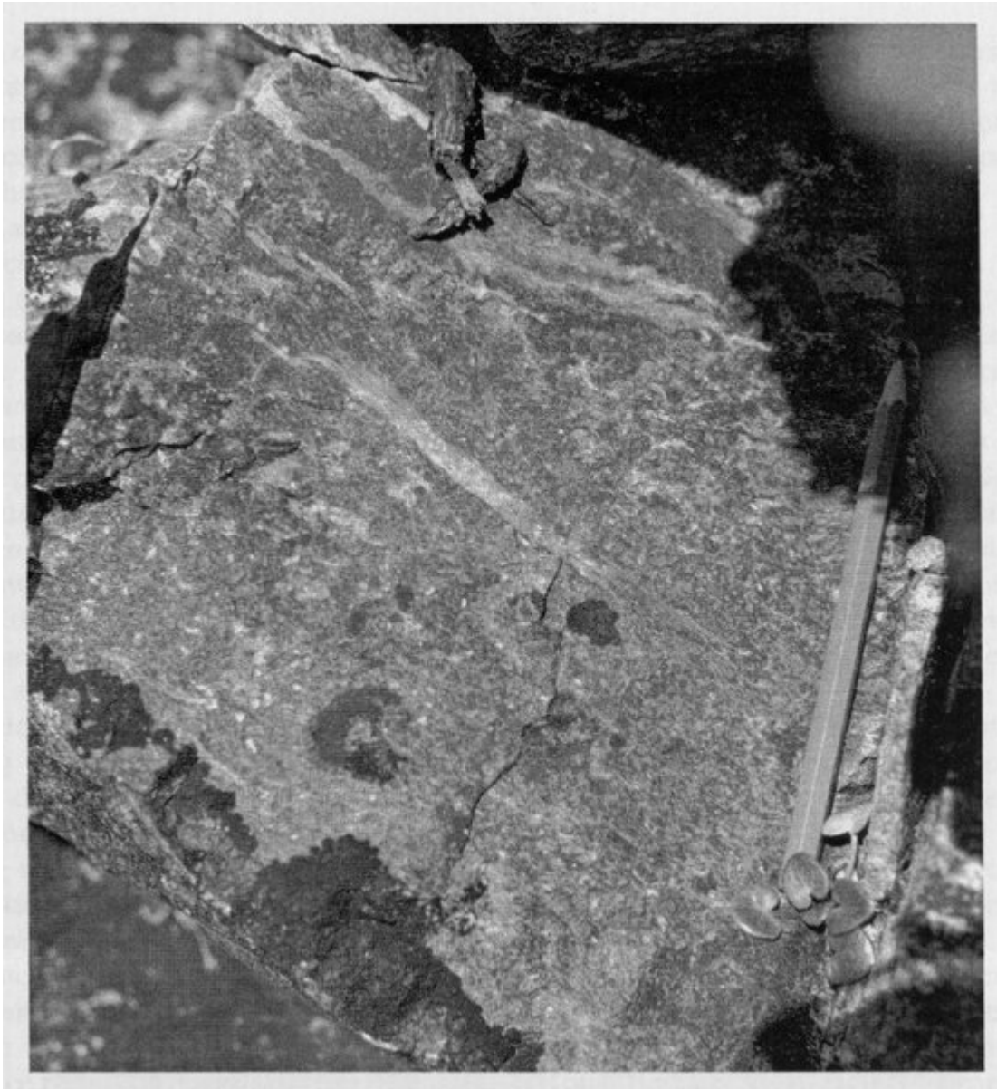
(Figure 6.15) Ragged, elongate pumice fragments up to 12 cm in length in the Cader Rhwydog Tuff, Cader Rhwydog, Ramsey Island.