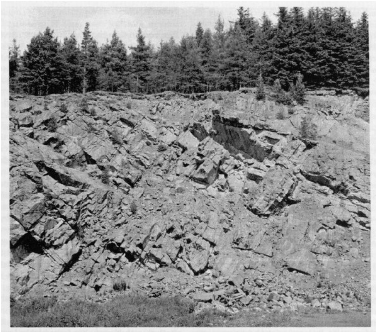
(Figure 3.7) Layered olivine-gabbro cumulates of the Huntly intrusion Lower Zone in the Bin Quarry. Layering dips at 50° to the NW but modal layering, 'sedimentary' structures and variations in mineral composition show that the sequence 'yongs' to the SE and hence is inverted.