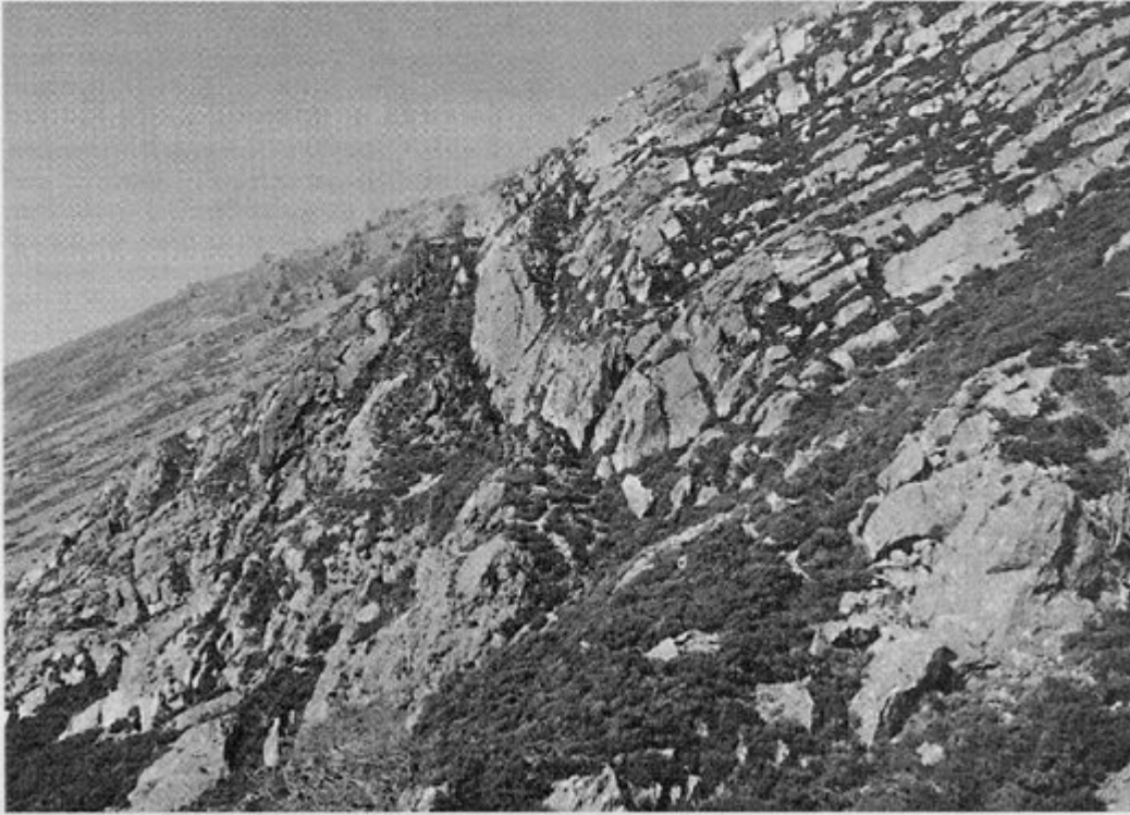
(Figure 6.31) The lower rhyolite (R) and ash-flow tuff (1) members of the Braich tu du Volcanic Formation separated by a thin sequence of marine siltstone, sandstone and basic tuffaceous sedimentary rocks (S) on the NE slopes of Nant Ffrancon [SH 648 621]. The columnar joints in the welded tuff (1) are perpendicular to its base, which dips steeply to the right. Reproduced from Howells et al. (1991).