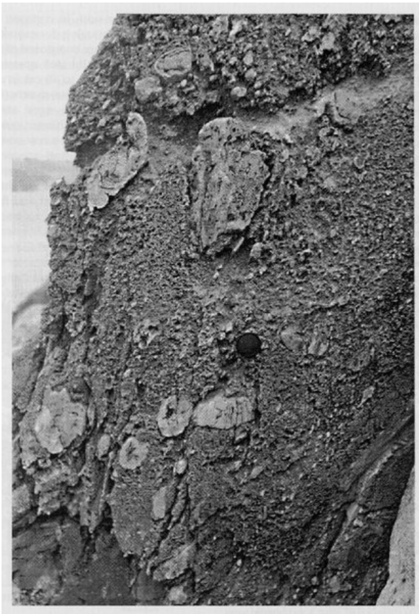
(Figure 6.18) Coarse lapilli-tuff of the Aberiddi Tuff Member, south side of Aberiddi Bay.