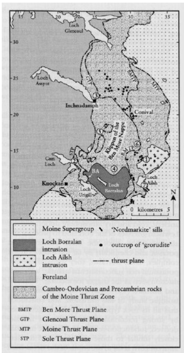
(Figure 7.2) Map of the Assynt district showing the major thrusts, the two major alkaline intrusions, and the distribution of two of the six types of minor intrusive rocks. BA is the critical locality, at Bad na h-Achlaise, where nepheline-syenites and pyroxenites of the Loch Borralan intrusion are intruded into one of the klippen (the Cam Loch Klippe) of the Ben More Nappe. GCR sites in the thrust zone related to minor intrusive rocks are shown by circled numbers. 'Gorudite': 1, Glen Oykel South; 2, Creag na h-Innse Ruaidhe. 'Hornblende porphyrite': 3, Cnoc an Droighinn; 4, Luban Croma. 'Vogesite': 5, Allt nan Uamh; 6, Glen Oykel North (diatreme). 'Nordmarkite': 7, Allt na Cailliche. (After Sabine, 1953 and Johnson and Parsons, 1979, fig. 3.)