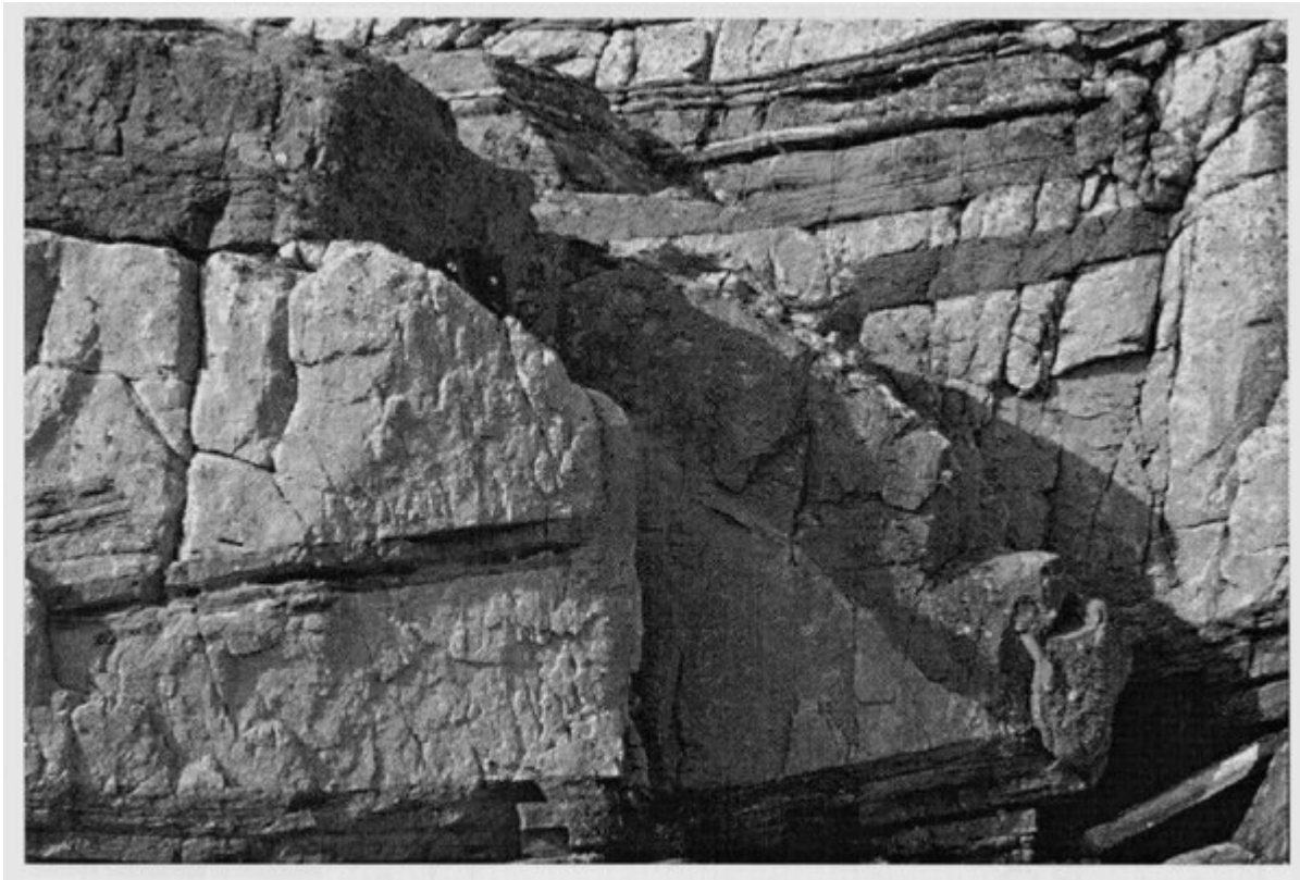
(Figure 8.12) Irregular porphyritic microgranodiorite sheet cutting the marginal contaminated granite along the eastern margin of the Ross of Mull pluton. The slab-like xenoliths of the Moine country rock generally retain a pre-emplacment attitude in this marginal sheeted complex. Carraig Mhor [NM 3678 1762].