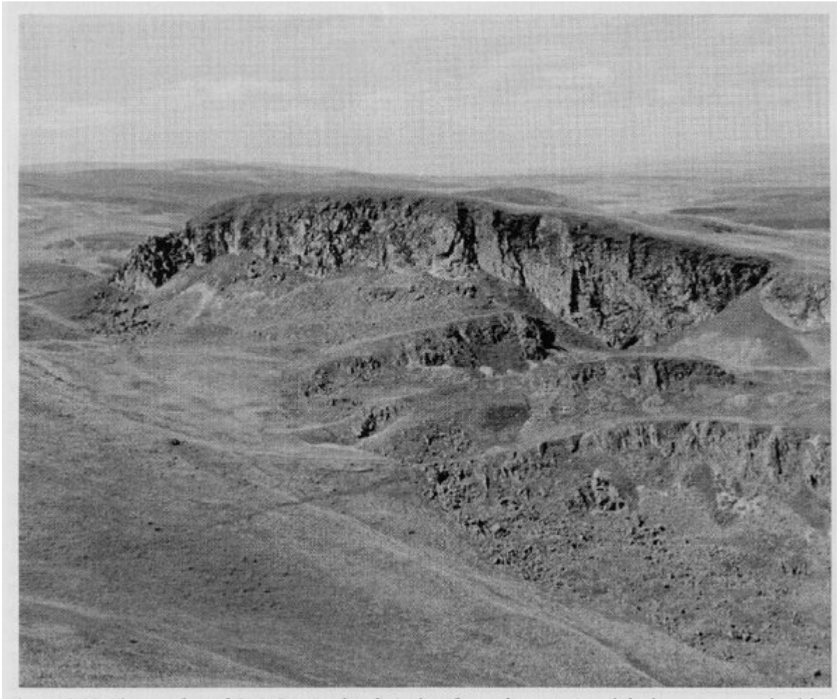
(Figure 9.30) The east face of Craig Rossie; rhyodacite lava forms the summit and the lower crags are landslips.