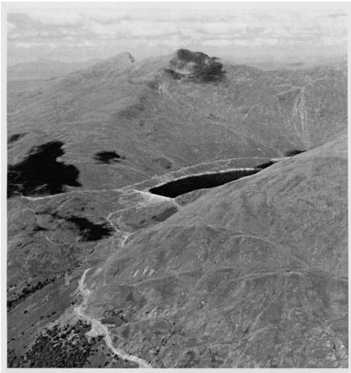
(Figure 8.19) Aerial view of the Cruachan Reservoir GCR site, Etive pluton, looking WNW to Ben Cruachan.