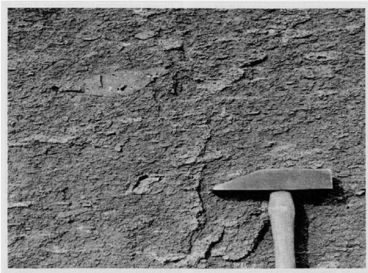
(Figure 9.48) Ignimbrite of the Grind of the Navir, Eshaness coast. The larger clasts are of alkali feldspar, commonly with a hollow core; smaller clasts are mainly collapsed pumice, glass shards and basic fragments. (Photo: BGS no. D1662.)