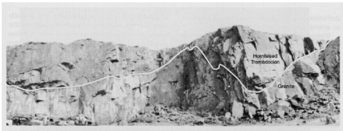
(Figure 6.57) The roof zone of the Tan y Grisiau granite intrusion, Ffestiniog Granite Quarry.