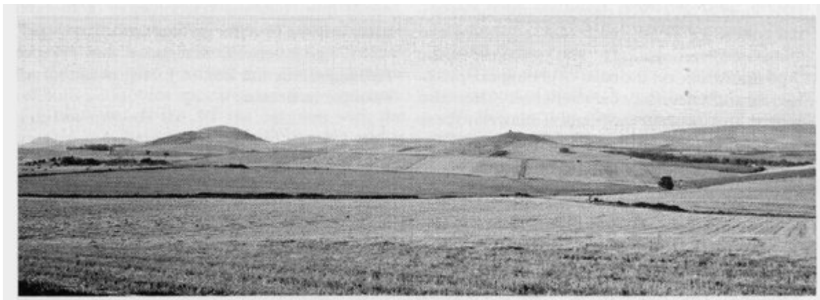
(Figure 3.12) The 'Red Rock Hills': Hill of Christ's Kirk (left distance) and Hill of Dunnydeer (centre distance, with ruined castle) from near Auchleven. The hills are composed of syenite and olivine monzonite and the foreground is underlain by olivine-ferrogabbros, all of the Upper Zone, Inch intrusion.