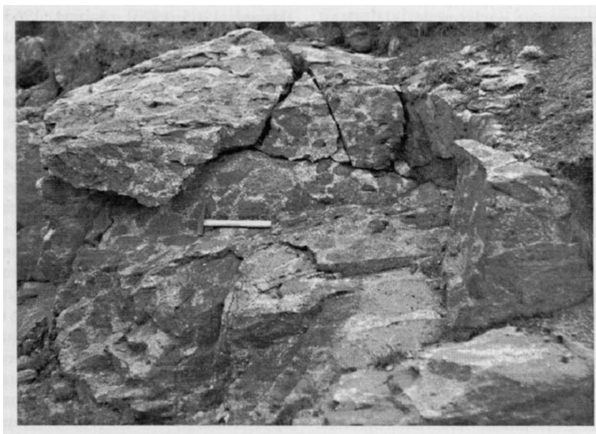
(Figure 8.9) Mafic microgranular enclaves (MME) in porphyritic biotite granodiorite of the Strontian pluton, Rubh' an Torr-mholaich, Loch Sunart [NM 8133 6015].