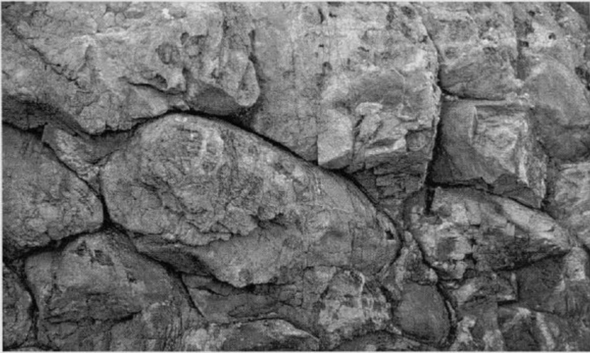
(Figure 6.11) Pillow lava from the Fishguard Volcanic Group, Strumble Head. The pillow in the centre of the photograph is 75 cm across (long axis).