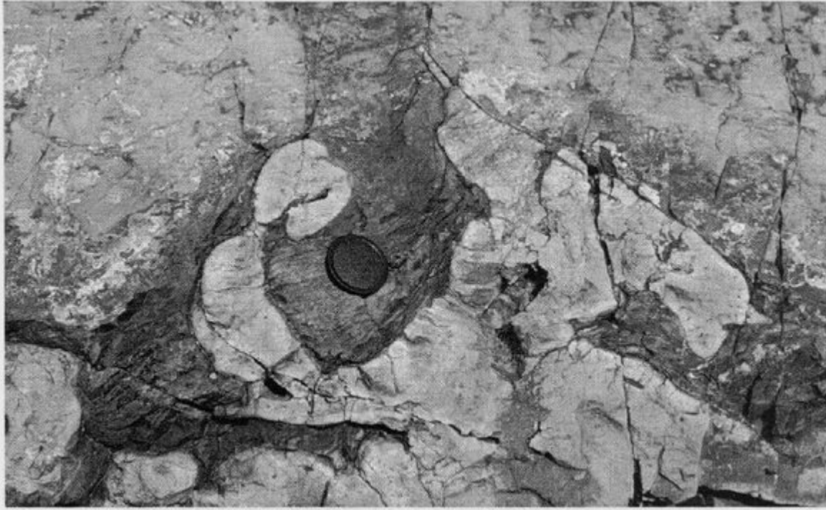
(Figure 6.13) Magma-wet sediment relationships at the base of a high-level basic intrusion, Pen Anglas. Magma has injected and loaded down into unlithified tuffaceous sediment, while the wet sediment has locally flamed up into the magma. Lens cap for scale.