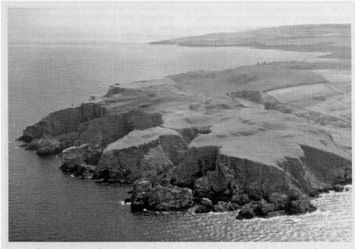
(Figure 9.42) St Abb's Head from the north. The volcanic rocks of the headland are separated from Silurian greywackes, forming the smoother topography beyond, by the St Abb's Head Fault; the glacial channel which follows the fault contains the Mire Loch, which is just visible. Note the pronounced scarp and dip slope topography of the volcanic rocks, which dip to the left and away from the camera.