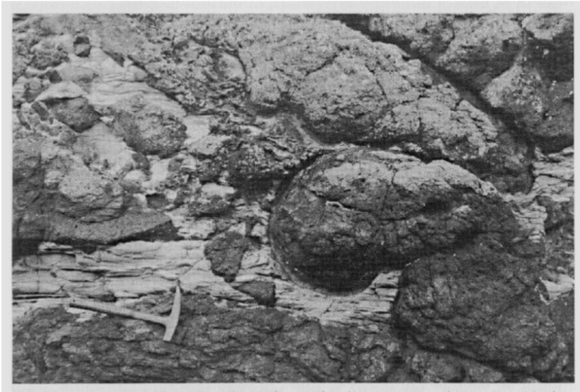
(Figure 9.35) Pillowed lobe of vesicular andesite in laminated sandstone at the base of the south-easterly of the Two Sisters stacks, Port Schuchan [NS 2468 1523].