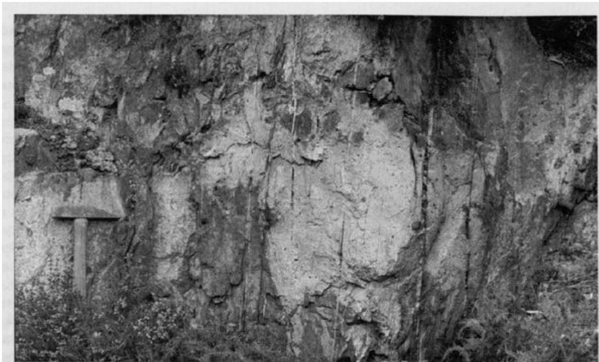
(Figure 6.55) Acid ash-flow tuff with blocks and clasts of mudstone, Middle Crafnant Volcanic Formation, Sarnau [SH 7721 5891].