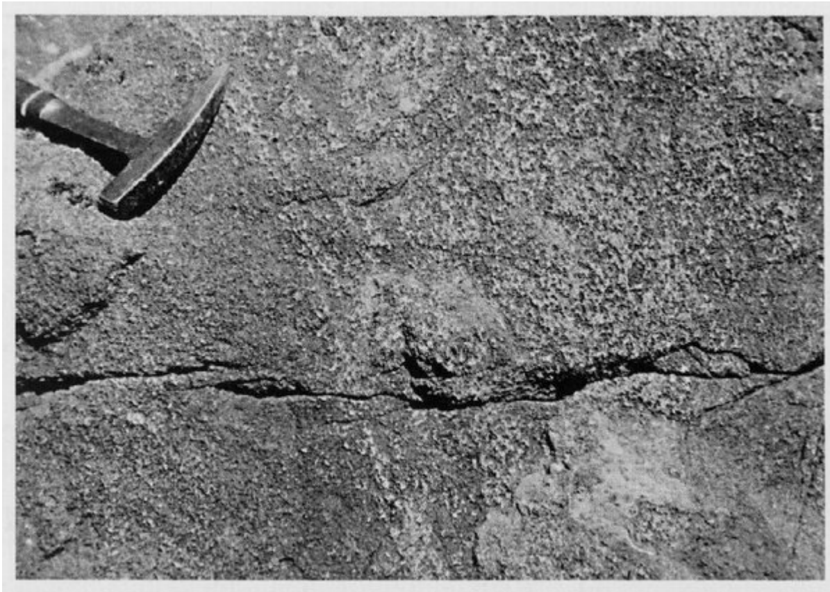
(Figure 6.22) Granophyric gabbro from the St David's Head Intrusion, showing slight variations in felsic components, east of St David's Head.