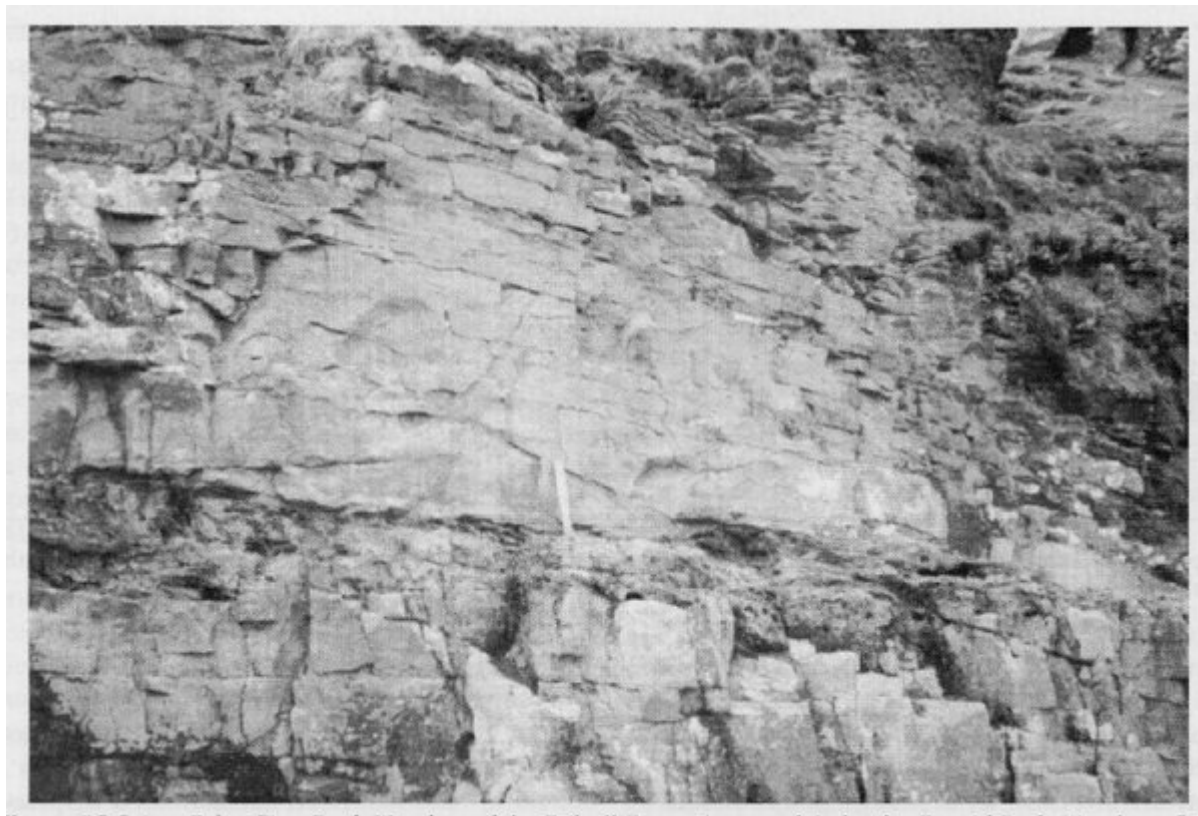
(Figure 12.8) An t-Sròn. Pipe Rock Member of the Eriboll Formation overlain by the Fucooid Beds Member of the An t-Sròn Formation. The contact lies at the base of the thinly-bedded weathered unit a little below the hammer-head.