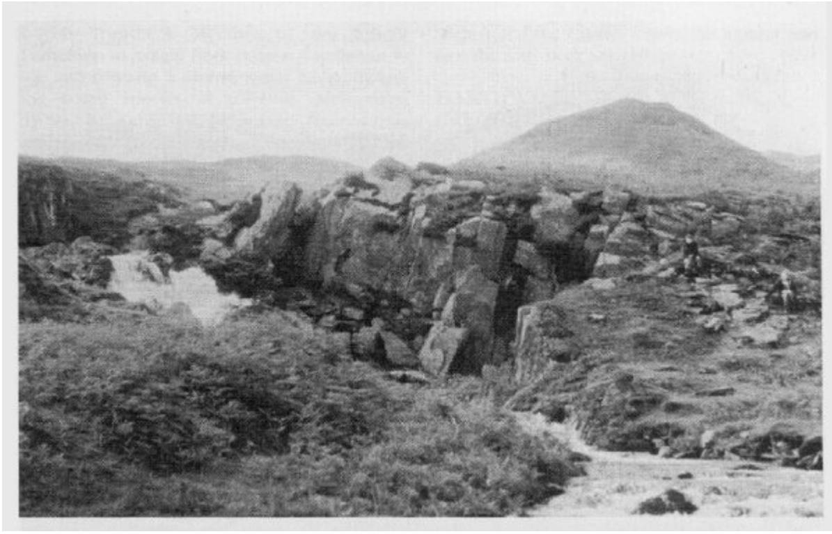
(Figure 11.7) Ashgill Beck, showing the type development of the Troutbeck Member of the Ashgill Formation, with the Old Man of Coniston (Borrowdale Volcanic Group) in the background.