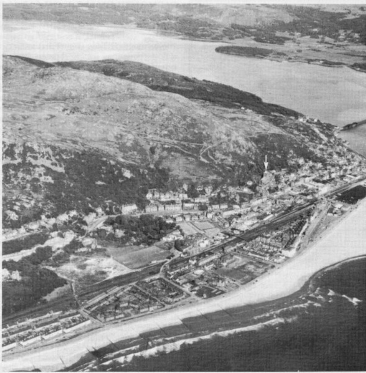
(Figure 3.4) Barmouth, viewed from the west. To the left, greywackes of the Rhinog Formation (Lower Cambrian) form wooded outcrops above the town. The smoother terrain beyond is occupied by the Hafotty Formation (St David's Series), the manganiferous basal beds lying approximately along the line of the track that extends from the church (centre right, arrowed) obliquely up the hill to the left. The rougher highest ground consists of Barmouth Formation greywackes, with the Gamlan, Clogau and Maentwrog formations beyond. The far side of the Mawddach Estuary is made up of upper Cambrian and lower Ordovician rocks.